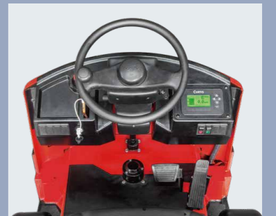
Modern outline design with LCD instrument and USB charging port