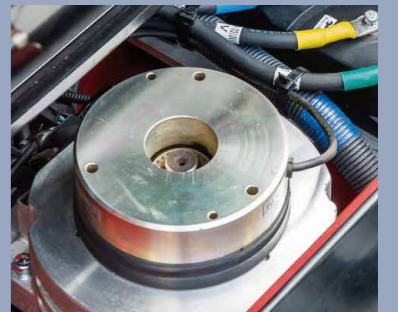
Electrical Park Brake (EPB) system