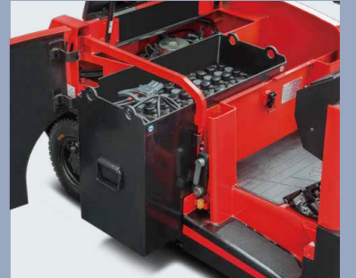
Battery side roll out is taken as the standard configuration in order to easily and fast replace the battery