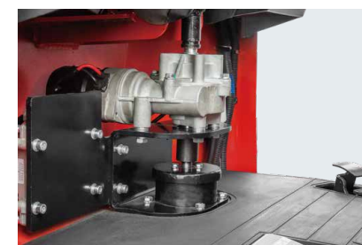
Electronic power steering system (for stand-up driving type tractor)